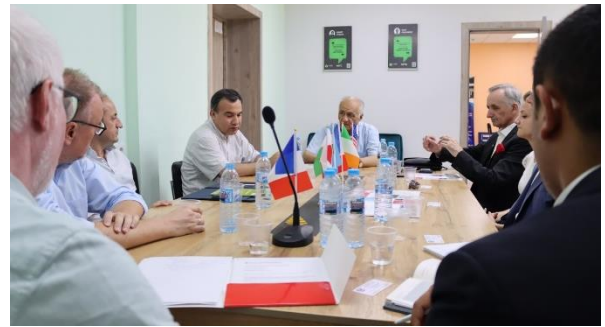
Meeting at the Samarkand Branch of Tashkent State University of Economics