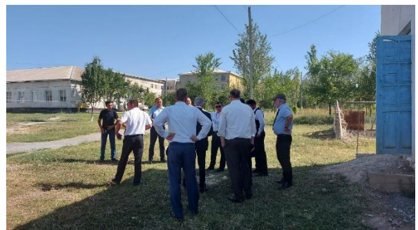
Some impressions from the delegation trip and their visit to different institutions, organizations, and their representatives

The goal is to implement “dual education” for young agricultural students. Through this concept the students gain, beside the theoretical knowledge, practical skills in vegetable and fruit cultivation, cattle breeding, and many other areas of farming. Combined with the business and financial trainings of German Sparkassenstiftung this training model will become a “lighthouse project” for many other institutions in Uzbekistan. Further steps and necessary content will be developed together with HSWT in the following months.